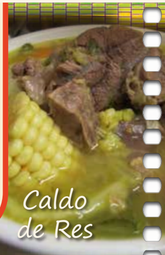
Caldo de Res

Crispy fried strips of corn tortilla in a tomato-based Mexican soup with chicken stock, spicy peppers, avocado, cheese, cilantro and lime - 10.99