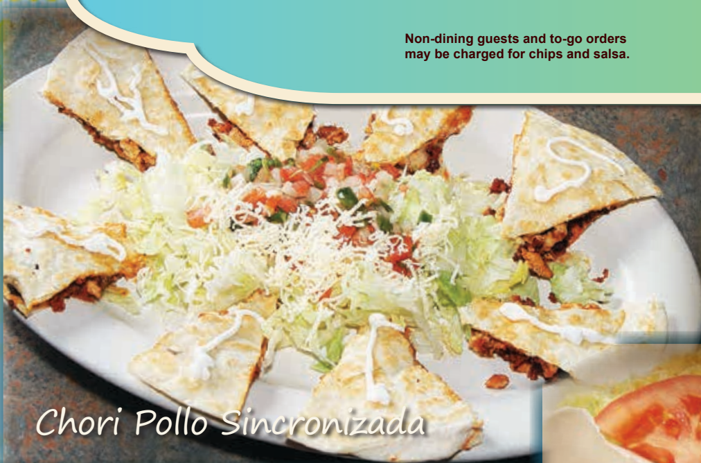
Chori Pollo Sincronizada

Non-dining guests and to-go orders may be charged for chips and salsa.