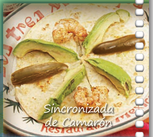
Sincronizada de Camarón