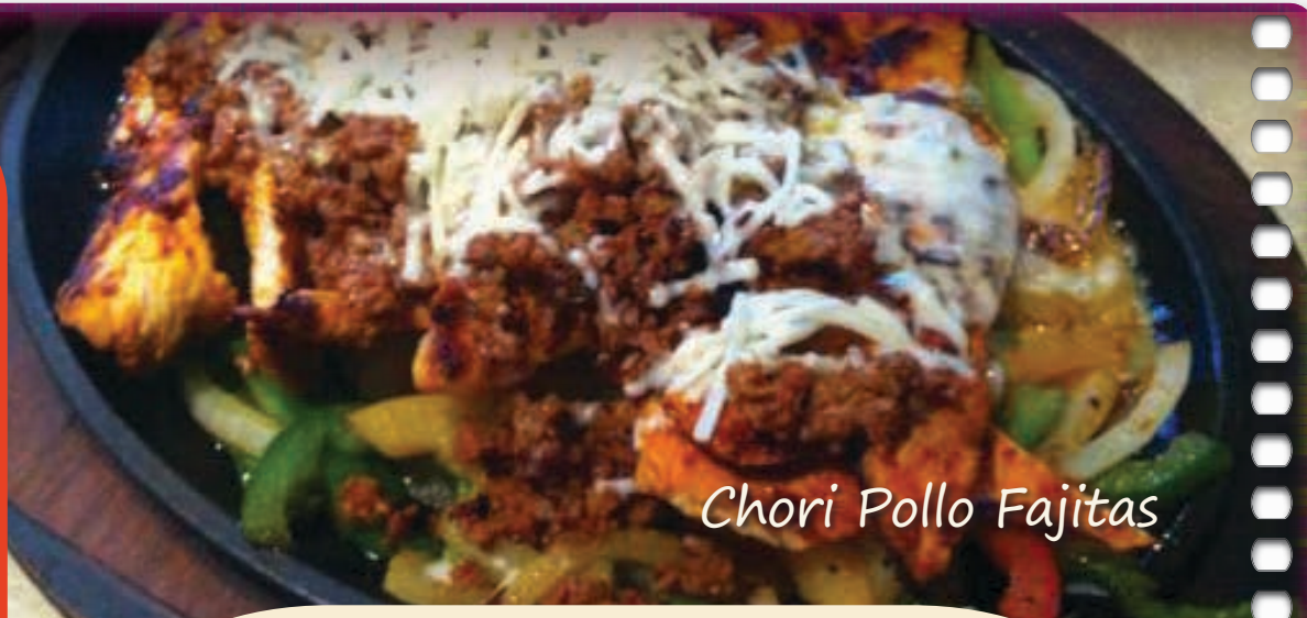
Chori Pollo Fajitas

T-bone steak and grilled shrimp covered with salsa ranchera. Served with rice and tortillas - 25.99