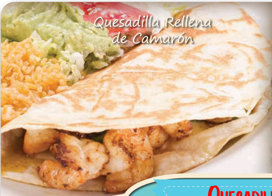
Quesadilla Rellena de Camarón