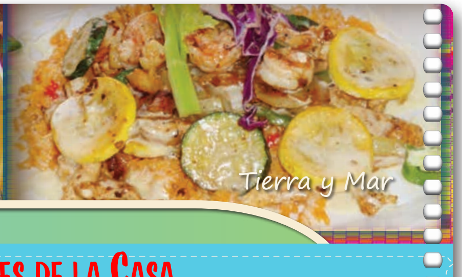
Tierra y Mar