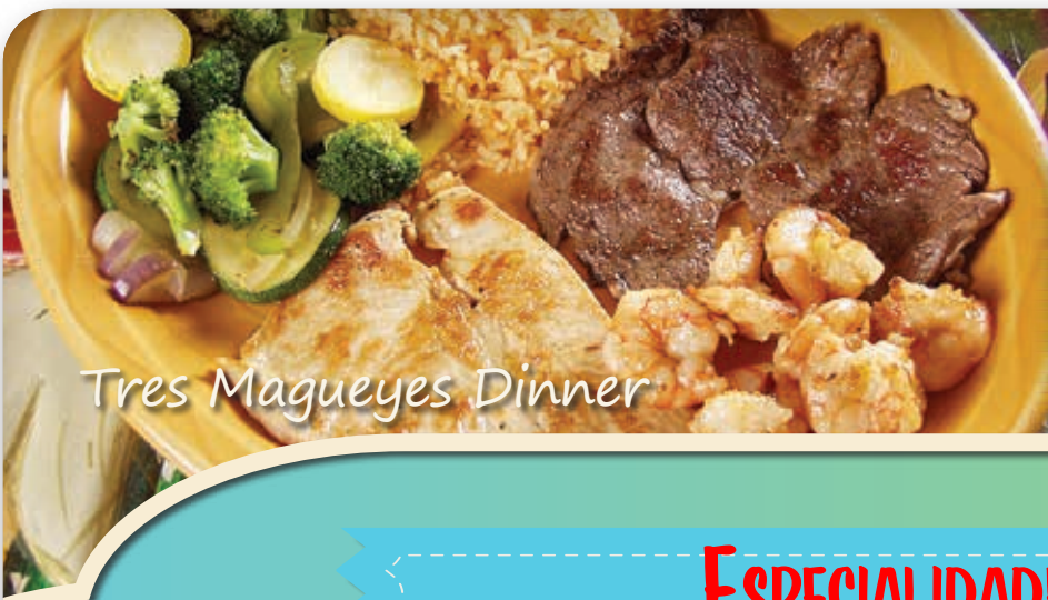
Tres Magueyes Dinner