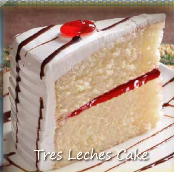
Tres Leches Cake