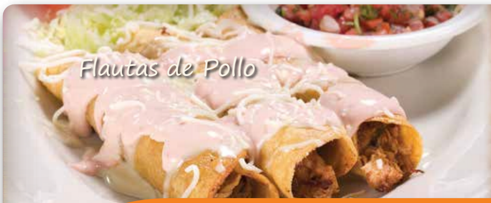
Flautas de Pollo