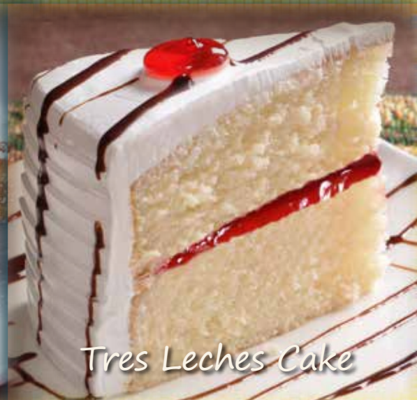
Tres Leches Cake