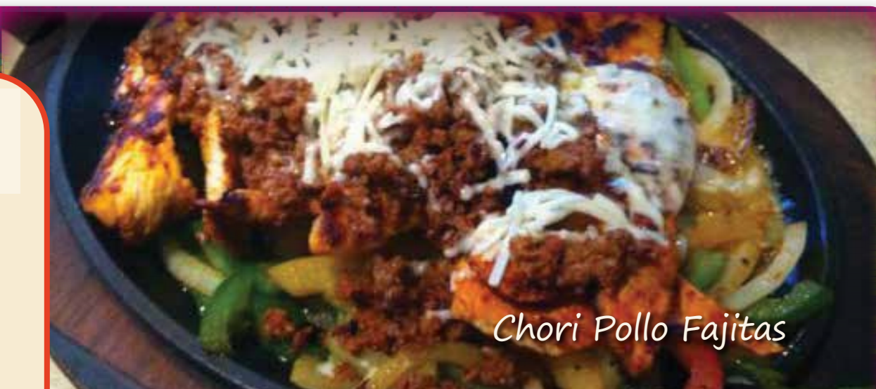
Chori Pollo Fajitas

(Bistec y Camarones) T-bone steak and grilled shrimp covered with salsa ranchera. Served with rice, salad and tortillas - 17.99