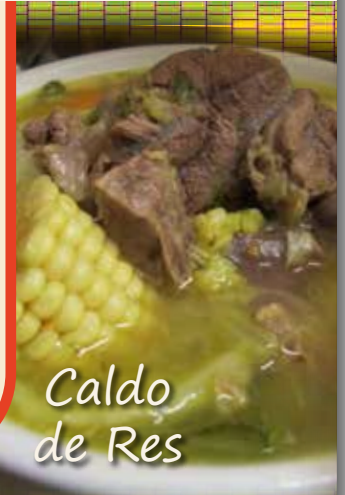
Caldo de Res

Crispy fried strips of corn tortilla in a tomato-based Mexican soup with chicken stock, spicy peppers, avocado, cheese, cilantro and lime - 8.50