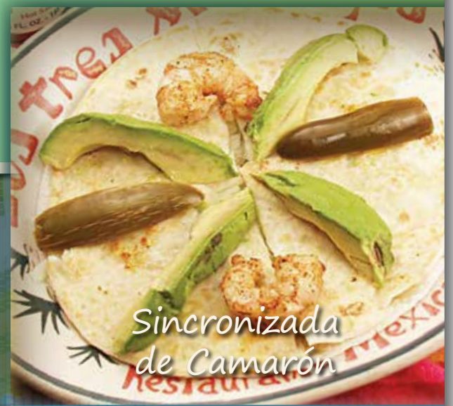
Sincronizada de Camarón