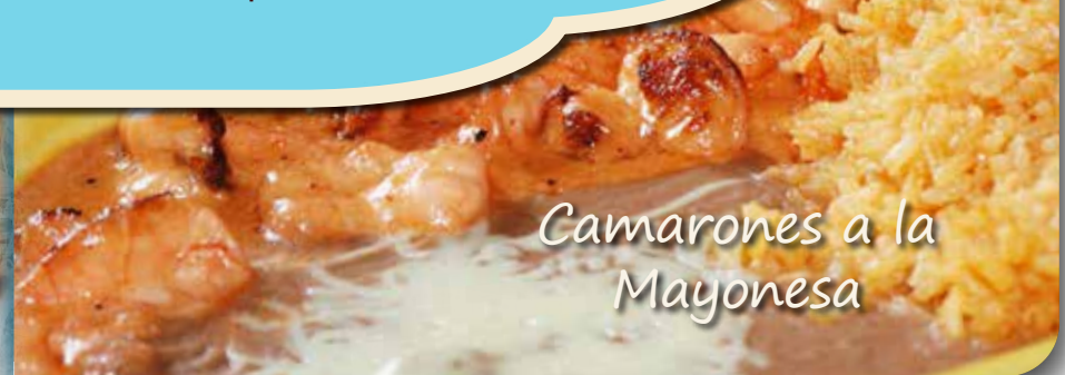
Camarones a la Mayonesa