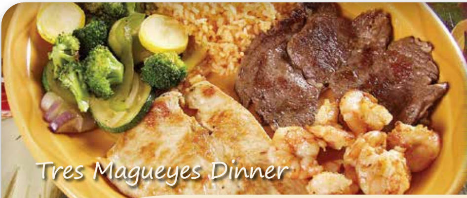
Tres Magueyes Dinner