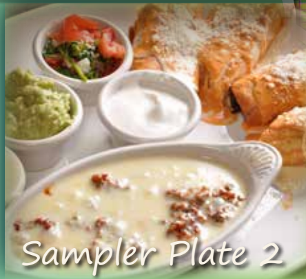
Sampler Plate 2

Chori dip and chicken rolls served with guacamole, sour cream, pico de gallo and cheese dip - 11.99