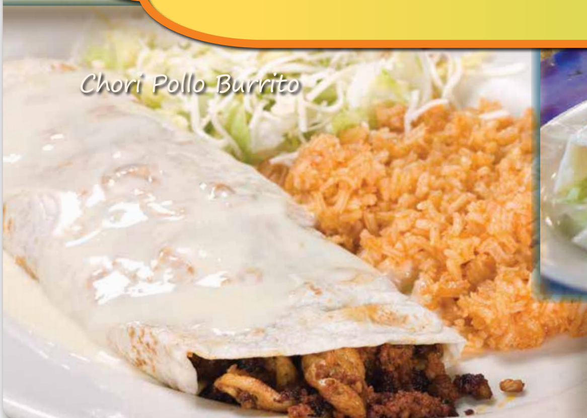
Chori Pollo Burrito