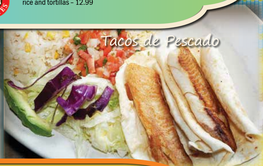
Tacos de Pescado