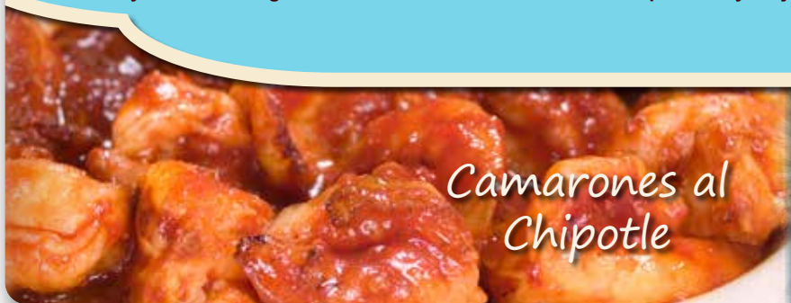
Camarones al Chipotle

*Consumer Advisory: Consumption of raw or undercooked foods such as meat, poultry, seafood, shellfish or eggs may increase your risk of foodborne illness. If you request raw or undercooked food you are putting yourself in danger of food-borne illness and take the responsibility on yourself to order such products.