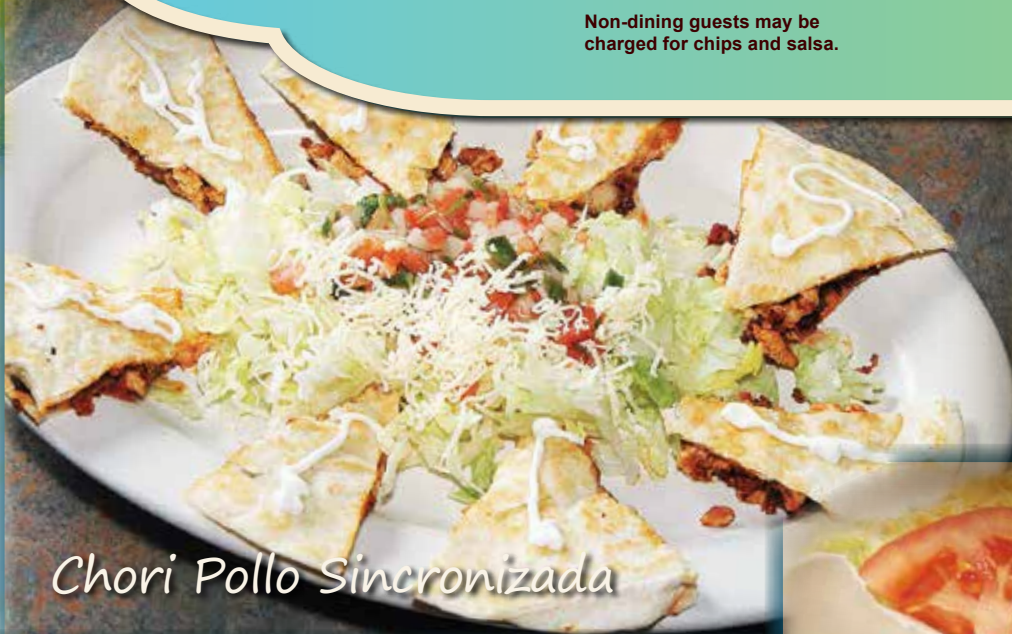
Chori Pollo Sincronizada

Non-dining guests may be charged for chips and salsa.