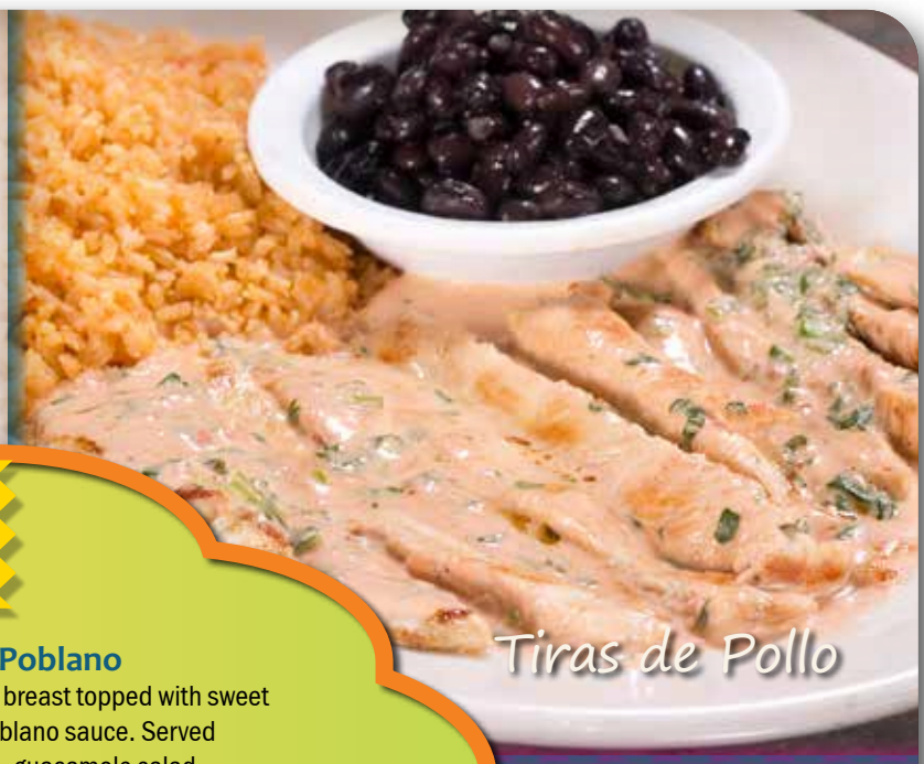
Tiras de Pollo