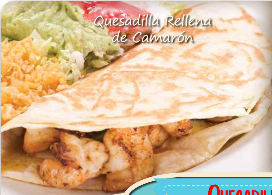
Quesadilla Rellena de Camarón