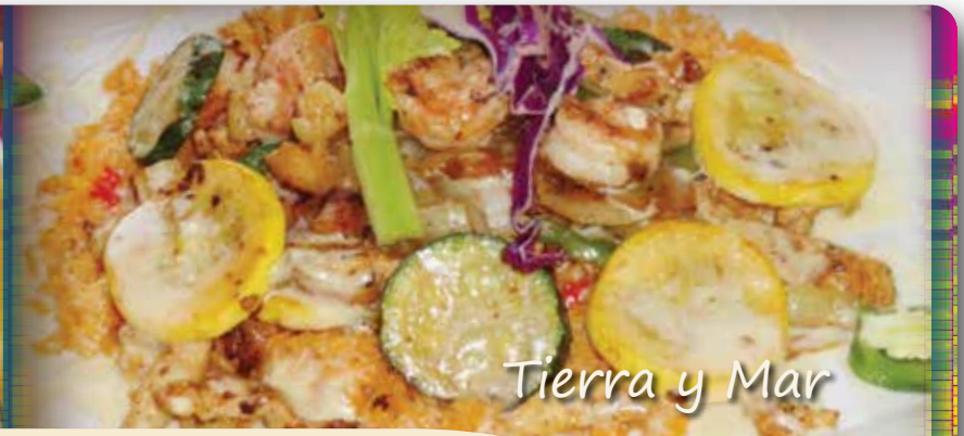
Tierra y Mar